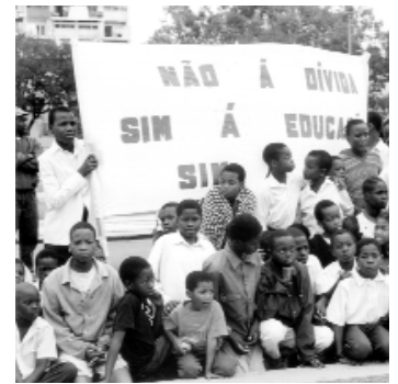
MOZAMBIQUE RALLY IN MAPUTO > Mozambique on debt and education issues. Organised by the partner organisations of Oxfam Community Aid Abroad in the Mozambique Debt Group.