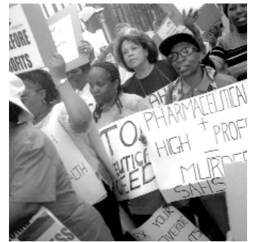
PROTEST OUTSIDE THE HIGH COURT IN PRETORIA, SOUTH AFRICA > International pressure forced drug companies to drop their case against the South African government and allow the production of cheaper HIV/AIDS drugs.