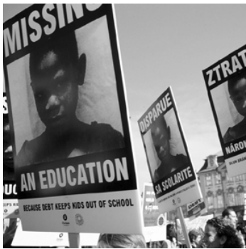
PLACARDS > Oxfam Community Aid Abroad and the Oxfam International network are part of a diverse global movement against poverty. Here Oxfam protesters raise the issue of debt and education at the WTO meeting in Prague, September 2000.